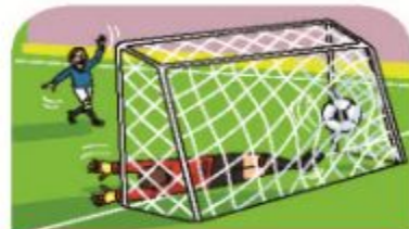
score a goal